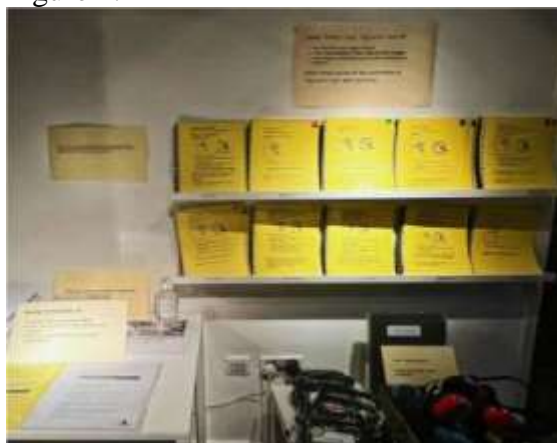
Figure 1: Special care area

The Manchester Museum of People's History has improved its multimedia materials for specific audiences, see Figure 1.