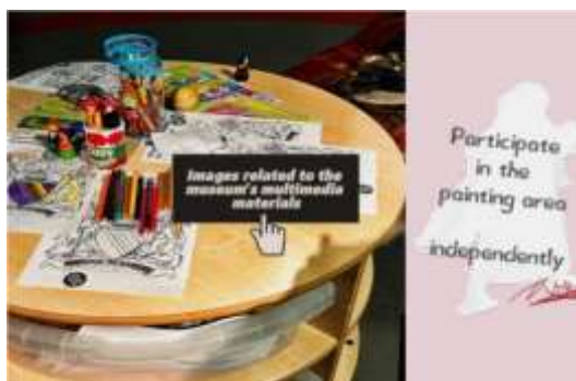
Figure 5: Self-study sharing area brush tool