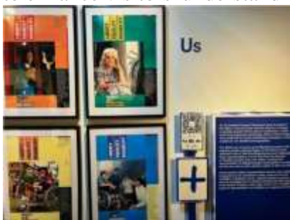
Figure 3: Continuous presentation of text and illustrations

The principle of continuity refers to the fact that presenting the corresponding text and pictures consecutively is easier for students to understand than presenting the text and pictures separately when giving multimedia explanations [8] . Research has shown that in problem-solving, students who read the article and viewed the corresponding illustrations at the same time produced 75% more useful answers than students who read the text and illustrations separately [9][10] . More importantly, sequential presentation can help students make closer connections and associations between text and pictures, thereby improving the absorption and comprehension of information. Researchers have noticed a similar pattern and referred to it as the proximity effect [11] . Therefore, the corresponding text and images must be present in working memory at the same time to facilitate the construction of reference links between them [8] . In short, digital museums should adopt a sequential presentation to enhance visitors' understanding and memory of exhibit content (see Figure 3).