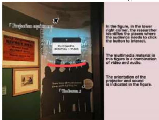
Figure 4: Personalized multimedia interactive buttons

of information during video playback. Through this personalized interaction, the audience can actively interact with the multimedia material according to their wishes (see Figure 4).