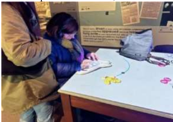
Figure 2: Interactive experience game

enabling them to immerse themselves in the game process and increasing the frequency of interaction between the audience and the multimedia materials, thus realizing the effect of augmented reality interaction. Visitors can experience firsthand the hard life of the lower working class in different periods, such as the workflow of matchbox production workers, in the interactive games of the museum (see Figure 2).